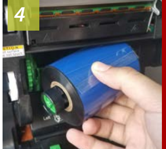
Load take-up spindle, from left to right; make sure collared end of spindle is on the right.