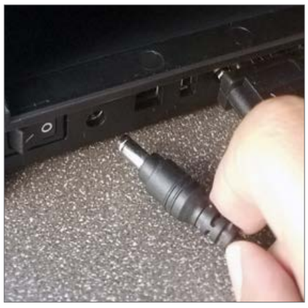
6. Connect power supply cord to printer; connect cord to SURGE PROTECTOR (not supplied, and not a "power strip". This will help protect your printer from power surges and program failures).