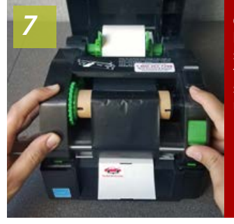
Gently hand-tighten spindles, taking up slack in ribbon.