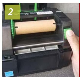
Release the ink carriage by gently pulling up on the green lever.