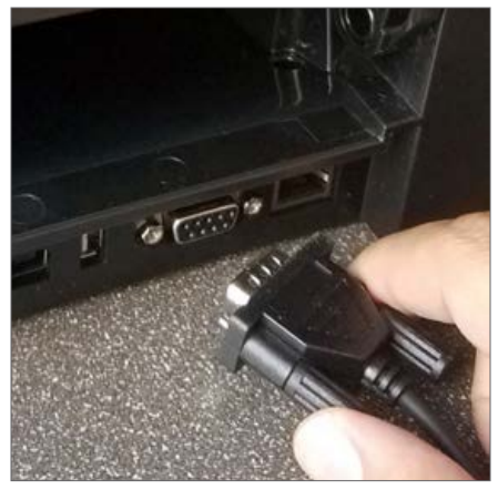
5. Connect the Striker Keypad to the printer