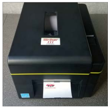
4. Close the Striker cover