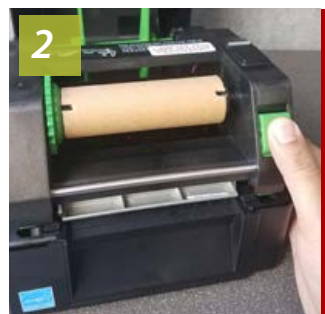
Release the ink carriage by gently pulling up on the green lever.