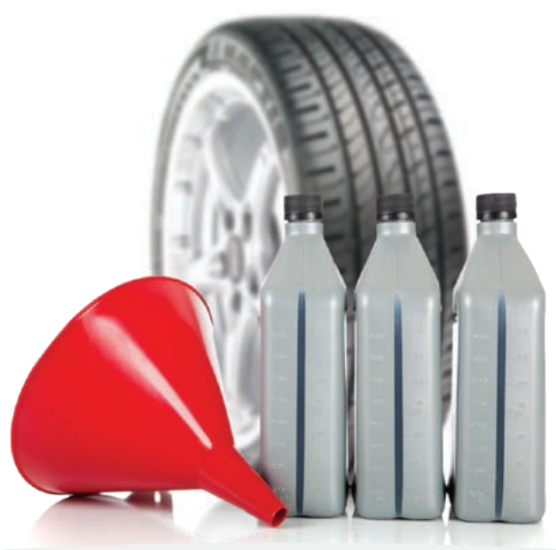
Copyright © 2021 Cobra Systems, Inc. All rights reserved