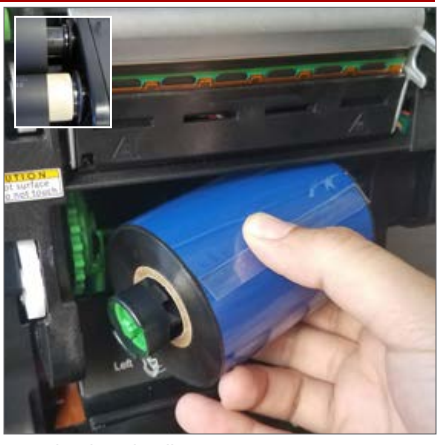
2. Load Striker Ink Rolls