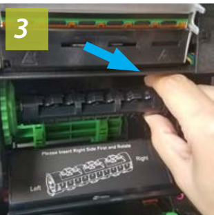
Load rear spindle with ink ribbon, from left to right; make sure collared end of spindle is on the right.