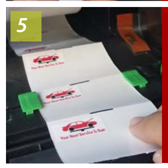
Guide the stickers through the printer, under and through the centered green guides.