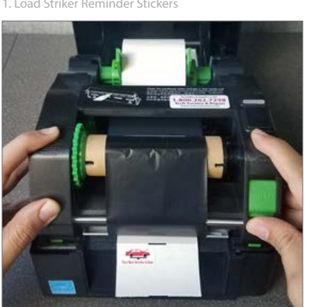
3. Clamp down ink carriage as shown