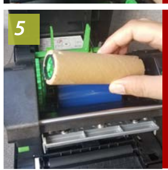
Feed ribbon, back to front, under the print head, taping securely to the take-up spindle. Dull side of ribbon will show.