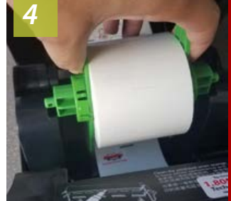
Slide the roll of stickers onto the sticker spindle; lineup spindle guides with spindle slots and place in printer.