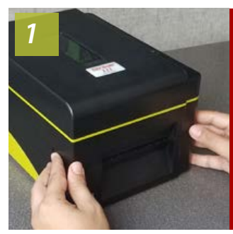
TURN OFF printer; open cover by pressing in on round white tabs on either side of printer.