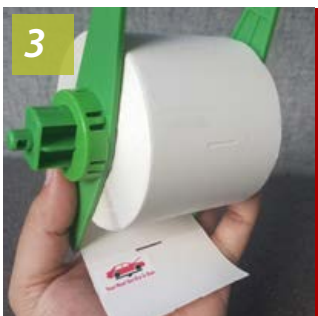
Load the Reminder Stickers onto the spindle, making sure the guides are centered.