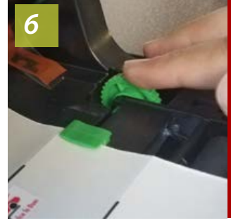
Make sure the stickers travel under the green print sensor.