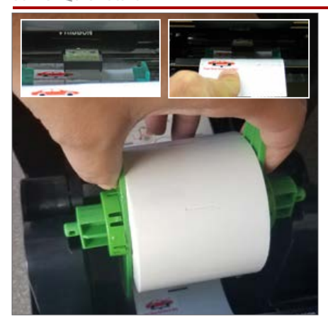
1. Load Striker Reminder Stickers