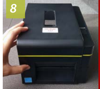
Press ink carriage down, back into printer, close printer cover you're ready to start printing!